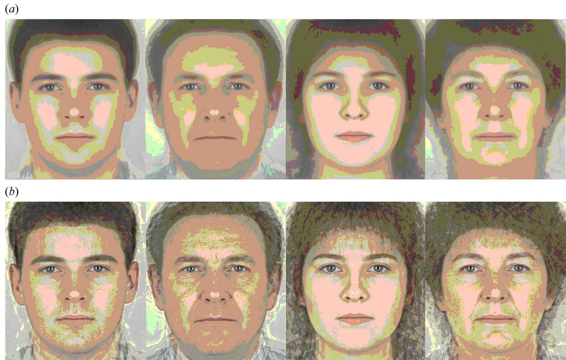
Figure 1. Composite male and female facial stimuli. (a) Composites formed by blending the colour and shape of individual faces within 5 yr age brackets 20–24, and 50–54 yr. (b) Composites formed with additional texture processing, which increases the visibility of lines and wrinkles and makes composite faces appear older.