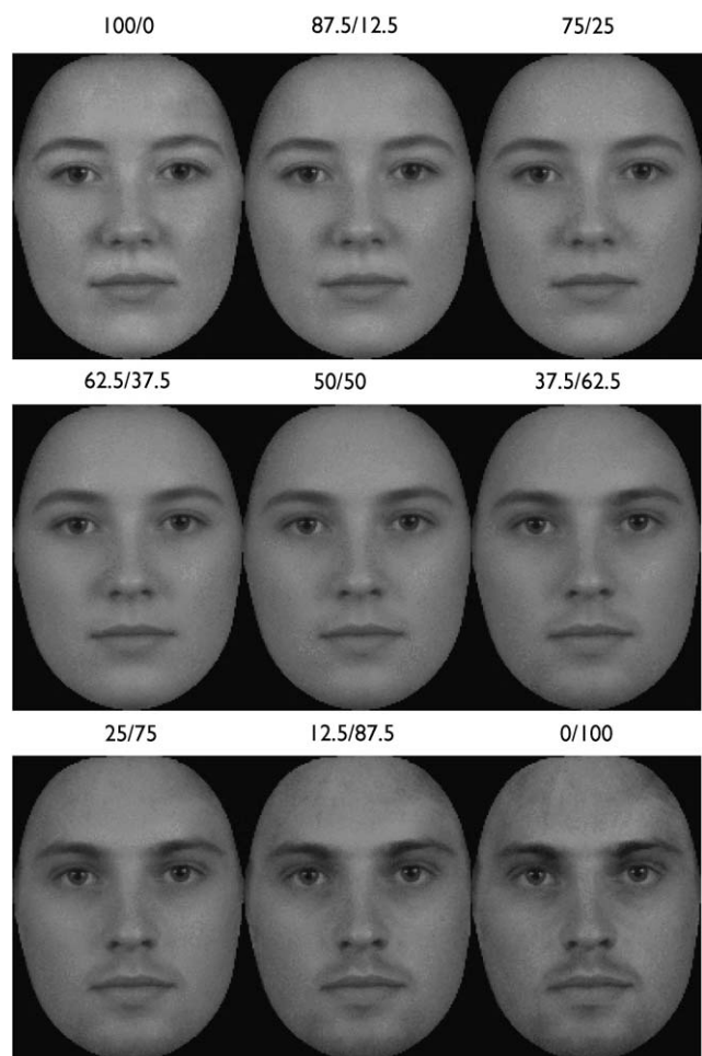
Fig. 1. A representative facial morph series. The numbers above each face represent the female/male ratio of the given composite face.

of the same morphed images along the gender axis one by one and were asked to report the face where the gender transition is first perceived. The instruction given to the subjects was: "Previously you determined the person on the last image as male/female. Please choose now the first face of the continuum which matches your selection." Suppose, for example, that in Fig. 1 the center row right stimulus is reported as the face where the female to male transition occurs. In this case the percentage of sexual dimorphism, required for gender decision, is 62.5%. Four facial continua sequences (26 images each) were presented twice, starting either with 25% male/75% female (masculinisation) or with 75% male/25% female faces (feminisation), giving eight trials in all. Raw gender transition data were entered into a one way ANOVA with the applied odorant as factors (3: water, androgen and estrogen). Fisher LSD tests were used for post-hoc comparisons of pairs of odorants (Fig. 2).